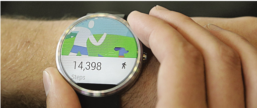
GOOGLE BOOSTS NEW GADGETS Wearable items among latest development.