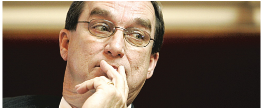
FEDS SEEKING STATE RECORDS Virginia senator's resignation being probed.