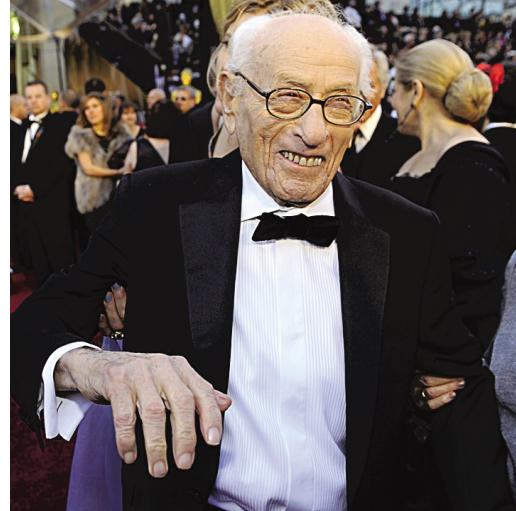
ACTOR ELI WALLACH DIES AT 98 He played character roles for decades.